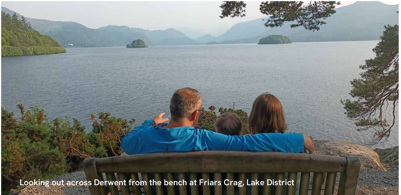
Looking out across Derwent from the bench at Friars Crag, Lake District